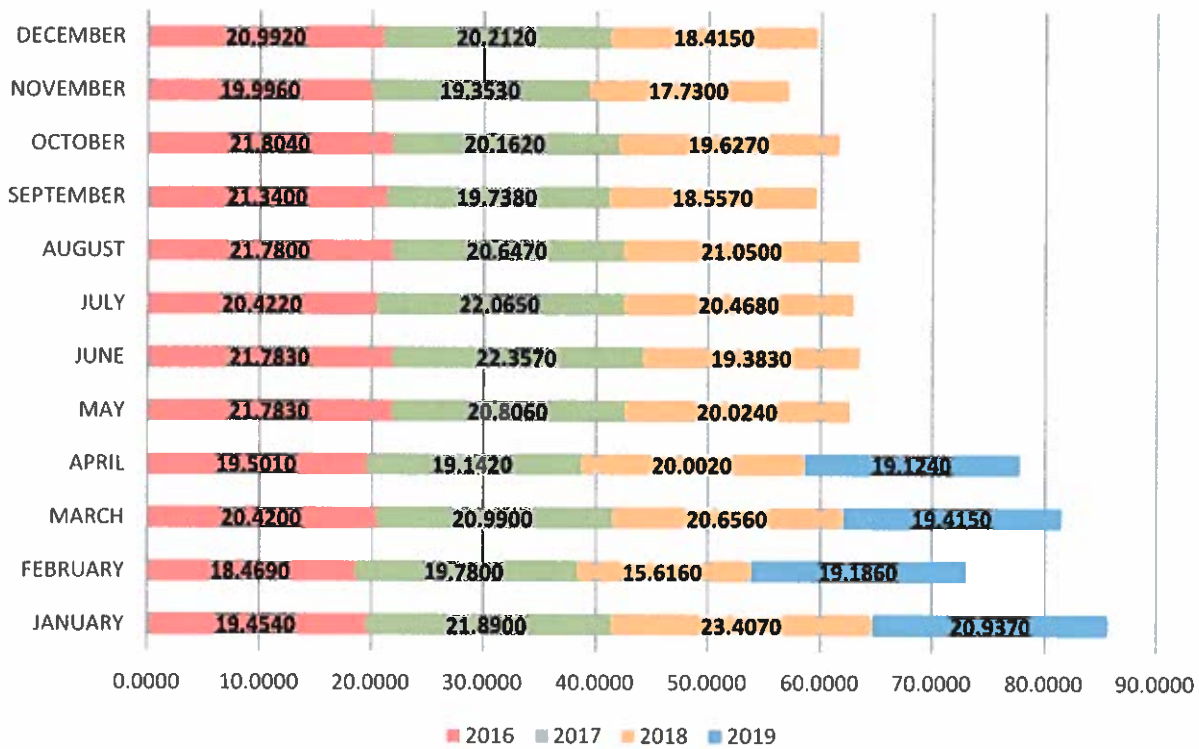
Annual Water Pumpages 2016 - 2019 Current Months Usage Compared to Past Annual Pumpages (in million gallons)